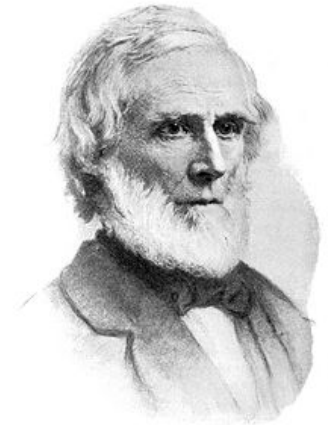
Horace Bushnell.

A blind spot, however, was in the practical and theoretical attitude toward children. Lost little souls, destined for perdition unless converted, constantly in danger of imperiling themselves further, not really among God's elect. Is that all there is to childhood from the perspective of faith? In 1847, Horace Bushnell, a Congregational minister in Detroit, published a revolutionary and controversial little tract, “Christian Nurture”, gradually expanded into a book, outlining a very different perspective on childhood and faith.